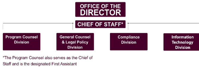
Figure XX: OGE Organizational Chart